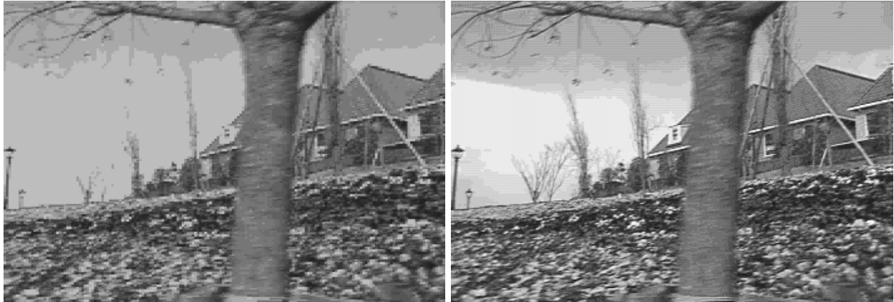
(a) Nonadaptive VQ (4-dimensional vectors, 256 code-words, MSE = 234.9, 1.487 bits/pixel).