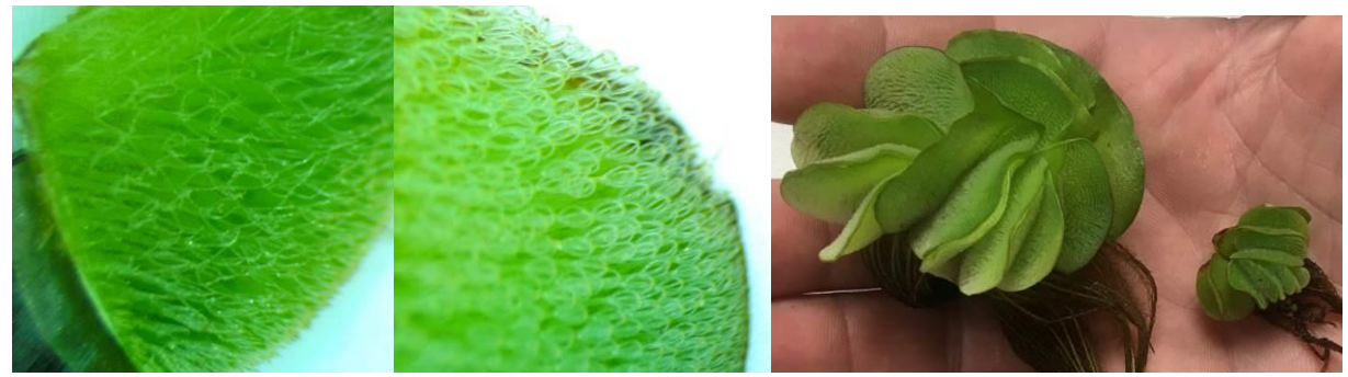
Figure 1. Image of common salvinia trichomes (left), giant salvinia trichomes (center), and both plants together (right).