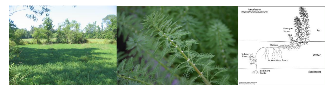
Figure 1. Image of parrot feather infestation (left), foliage (center), and line drawing (right).