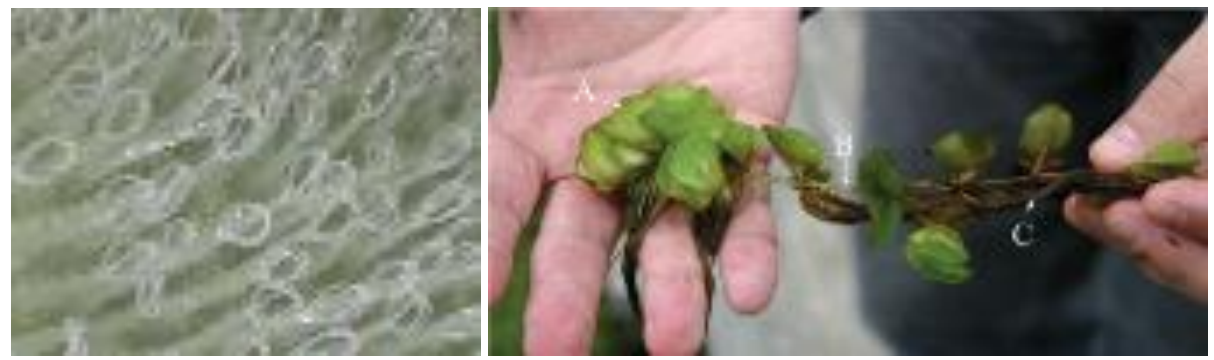
Figure 1. Image of giant salvinia trichomes (left), emergent fronds (right A), stem (right B) and submersed fronds (right C).