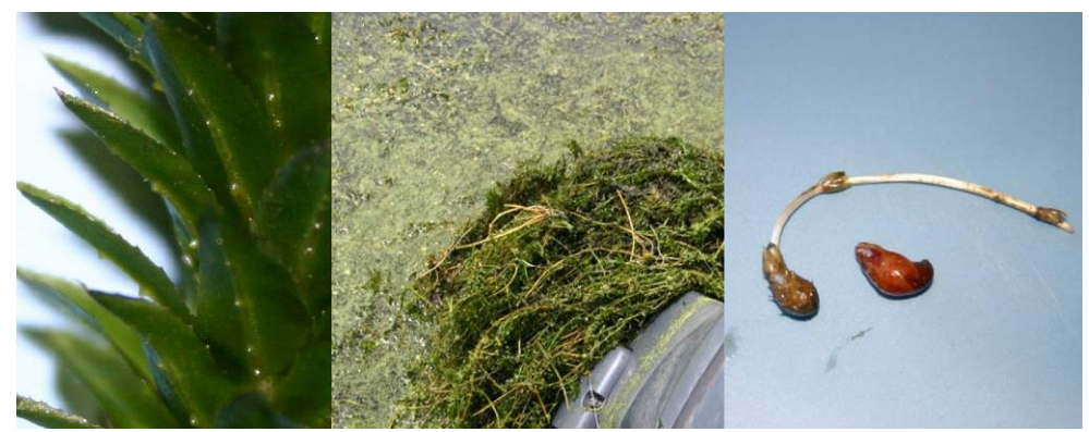
Figure 1. Image of spines on hydrilla leaves (left), dense infestation on a boat motor (center), and subterranean turions (right).