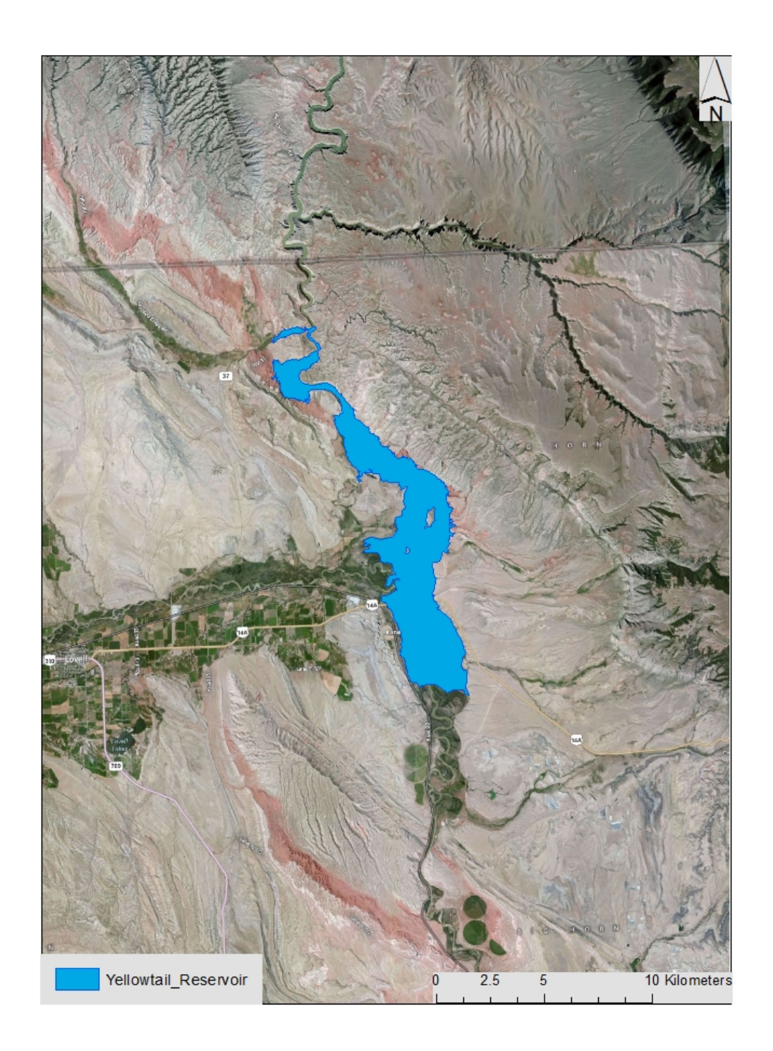
Figure 1. The survey area for 2012 encompassing Yellowtail Reservoir, WY. Surveys were conducted in July 2012.