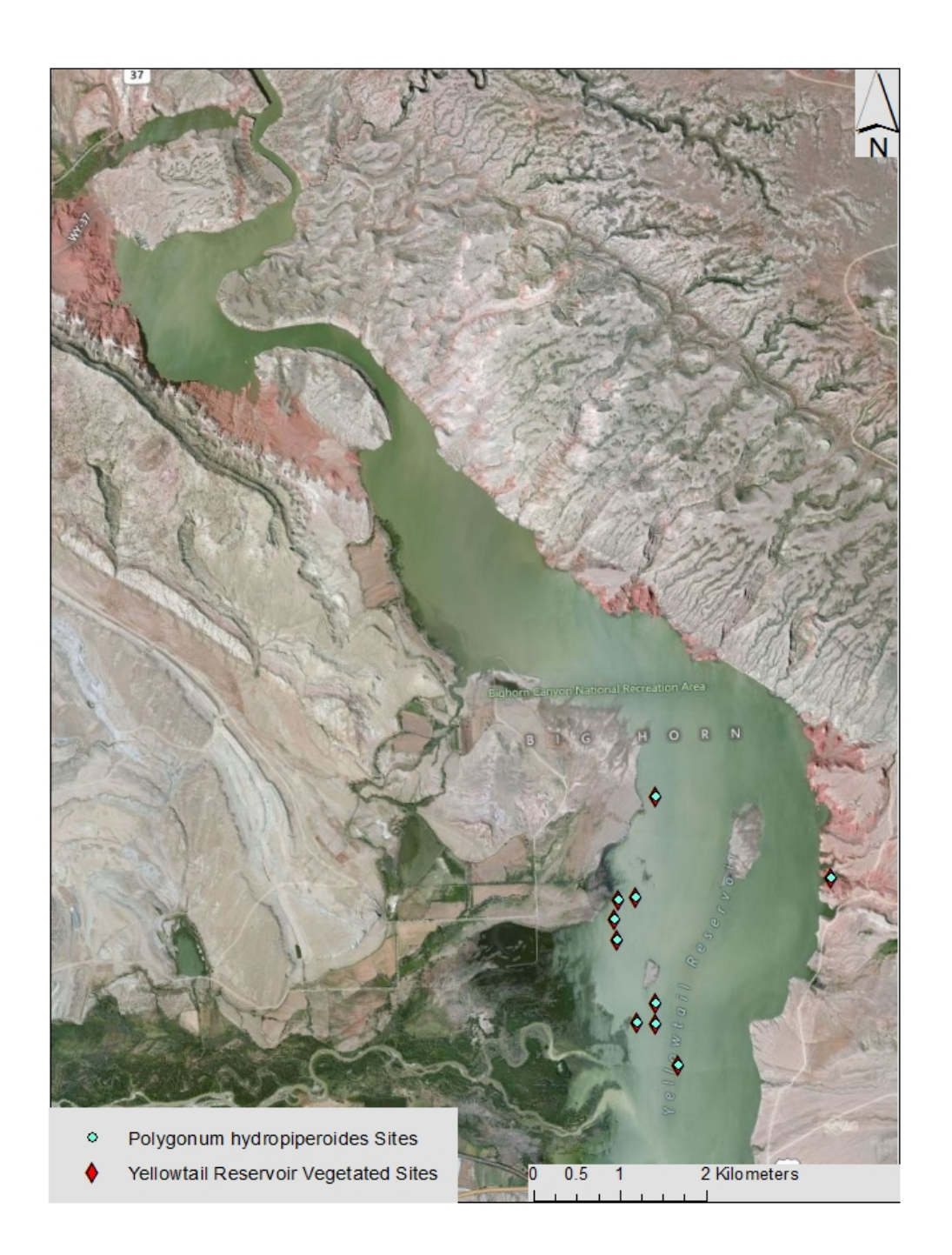
Figure 4. The distribution of Polygonum hydropiperoides in Yellowtail Reservoir during the littoral zone survey conducted in July 2012.

GRI Report 5058 Mississippi State University