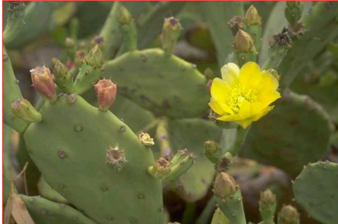
Fig. 3. Erect pricklypear ( Opuntia stricta ) with flower and young fruit.

Erect pricklypear normally flowers from May to June, but can flower sporadically from August to October. Flowers are yellow and about 2.5 to 3 inches across (Figure 3). The 1.5 to 2.5 inch long berry is first green eventually ripening to purple. The berry is typically obovoid and tapered to a slender base (Figure 4). The top is generally indented.