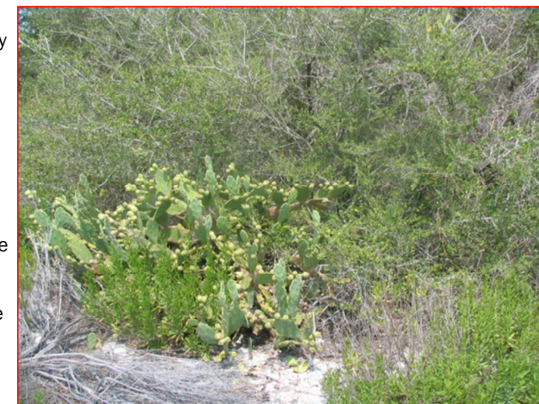
Fig. 2. Erect pricklypear ( Opuntia stricta ) on Mississippi barrier island.

Erect pricklypear is most frequent on dry sites, due to sandy soils or shell heaps. In Mississippi, it is found on relic shell middens and dunes of the barrier islands and adjacent mainland along the gulf coast (Figure 2). Although less common in Mississippi, it is not considered threatened or endangered. Erect pricklypear is generally found growing with cockspur pricklypear and devil's-tongue, where it occurs. It has been cultivated as an ornamental and considered a serious pest in other arid parts of the World. The World Conservation Union (IUCN) considers it one of the top 100 worst invasive alien species.