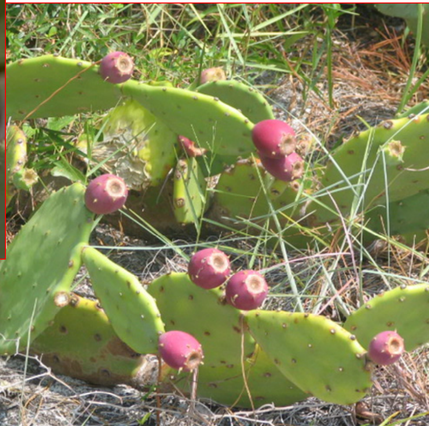
Fig. 4. Erect pricklypear ( Opuntia stricta ) with ripe fruit.

Assistance is also needed from individuals who can volunteer to monitor stands of native and ornamental cacti for the presence of the cactus moth. Individuals or groups willing to collaborate on this project can find additional information at: www.gri.msstate.edu/cactus_moth .