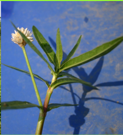
Fig. 2. The leaves of alligatorweed are elliptical, about 4" long and opposite. A single inflorescence may be formed, one per node.