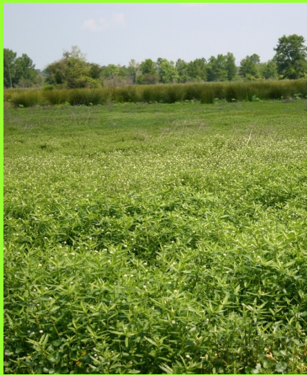
Fig. 1. Alligatorweed forms monospecific stands in moist soil or shallow water of large floating mats.