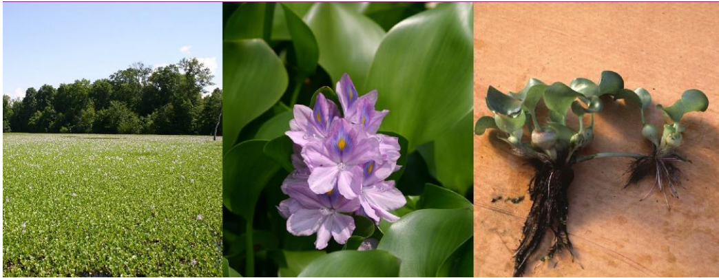
Figure 1. Image of water hyacinth covering a waterbody (left), flower (center), and mother and daughter plants (right). Images courtesy of J. Madsen and W. Robles (2009).