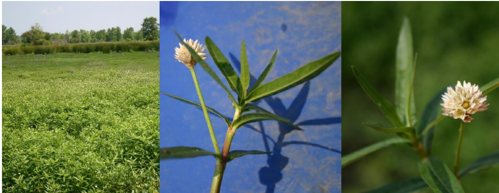
Figure 1. Image of alligatorweed infestation (left), leaf and inflorescence arrangement (center), and inflorescence (right).