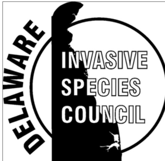
Figure 4. The first interagency state invasive species council, the Delaware Invasive Species Council, Inc., formed as a nonprofit in 1998. (Logo used with permission)