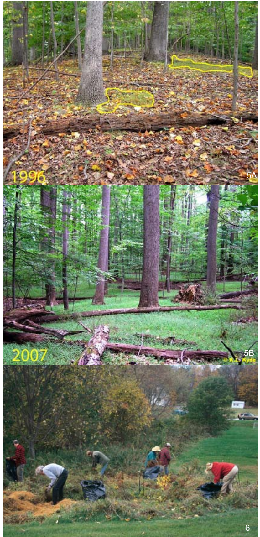
Figures 5-6. 5, Recreation of the Wavyleaf basketgrass Oplismenus hirtellus subsp. undulatifolius (Ard.) invasion over time in Patapsco Valley State Park, Maryland, USA. 5A, Department of Natural Resources; used with permission degree of infestation typical in 1996; 5B, 0in 2007. (Kerrie Kyde, Maryland); 6, IPANE weed pulling party for Mile-a-minute Vine ( Persicaria perfoliata ) in Connecticut. (Photo by Les Mehrhoff, IPANE).

Cactus Moth on barrier islands: The Cactus Moth management effort is an integrated approach to contain Cactus Moth to its current range. Fringe cactus moth populations on the Gulf of Mexico barrier islands, such as Dauphin, Little Dauphin, Petit Bois and Horn Island, as well as isolated populations at Fort Morgan, are managed through a combination of sterile moth releases and removal of infected Pricklypear Cactus plants ( Opuntia spp.) (Figure 9). Intensive surveys, using both traps and monitoring of remaining Opuntia cactus, are performed frequently to monitor for the presence of both wild and sterile insects. Infested plants are removed and carried to landfills, which are in turn monitored for escape of Cactus Moth using attractor traps. Thus far, intensive activity by partners including the US Department of Agriculture Animal and Plant Health Inspection Service Plant Protection and Quarantine program (USDA-APHIS-PPQ),