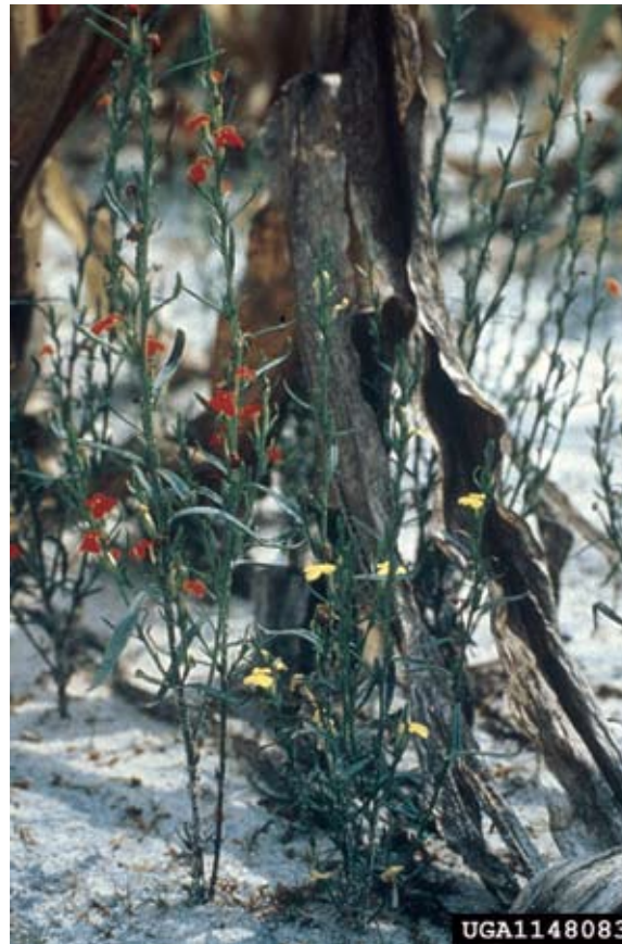
Figure 10. Witchweed, Striga asiatica (L.) Kuntze, a parasite of corn, has virtually been exterminated in the United States. (Photo by Rebecca S. Norris, USDA APHIS PPQ, Whiteville, North Carolina).

Sand, P.F., R.E. Eplee, and R.G. Westbrooks. 1990. Witchweed Research and Control in the United States. Monograph series of the Weed Science Society of America . 5:99-106.