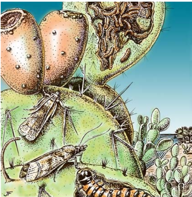
Figure 3. Cactus moth ( Cactoblastis cactorum ) depicted as the adult moth (left), egg stick (lower left), and feeding larvae (upper right and lower right) on a pricklypear cactus pad ( Opuntia sp.). (Original line drawing by Joel Floyd; used with permission).