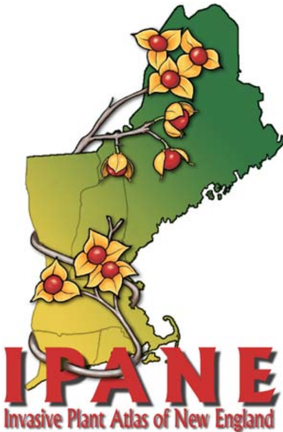
Figure 1. The Invasive Plant Atlas of New England is a volunteer citizen science network founded in 2001. (Logo used with permission).

(Connecticut, Maine, Massachusetts, New Hampshire, Rhode Island, and Vermont), IPANE's over-arching goal has been to establish an early detection network for New England (Figure 1). Volunteers are trained to look for new incursions of both known and anticipated alien invaders, and to gather and submit basic ecological information on invasive plants that encounter on the New England landscape via the IPANE Web site ( http://www.ipane.org ). IPANE also collects herbarium specimen data from major herbaria in the region. As part of IPANE's multifaceted approach, these data, along with the basic ecological data gathered by more than 700 trained volunteers, are coalesced to build the online information system available in map and database formats to give a composite picture of a species status and distribution in space and time (Figure 2). To date, IPANE volunteers have gathered more than 11,000 individual species occurrence records in New England. These data are used in scientific research to create predictive models, in regulatory actions, and as a basis for environmental monitoring and control efforts.