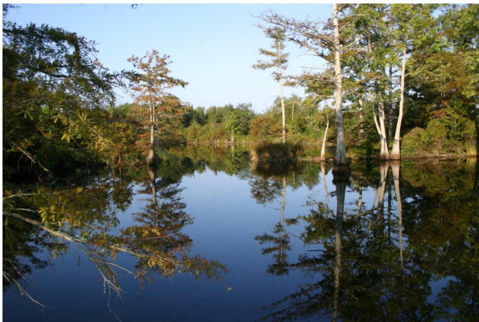
Figure 4. Duckweed ( Lemna minor ) at 120 DAT.