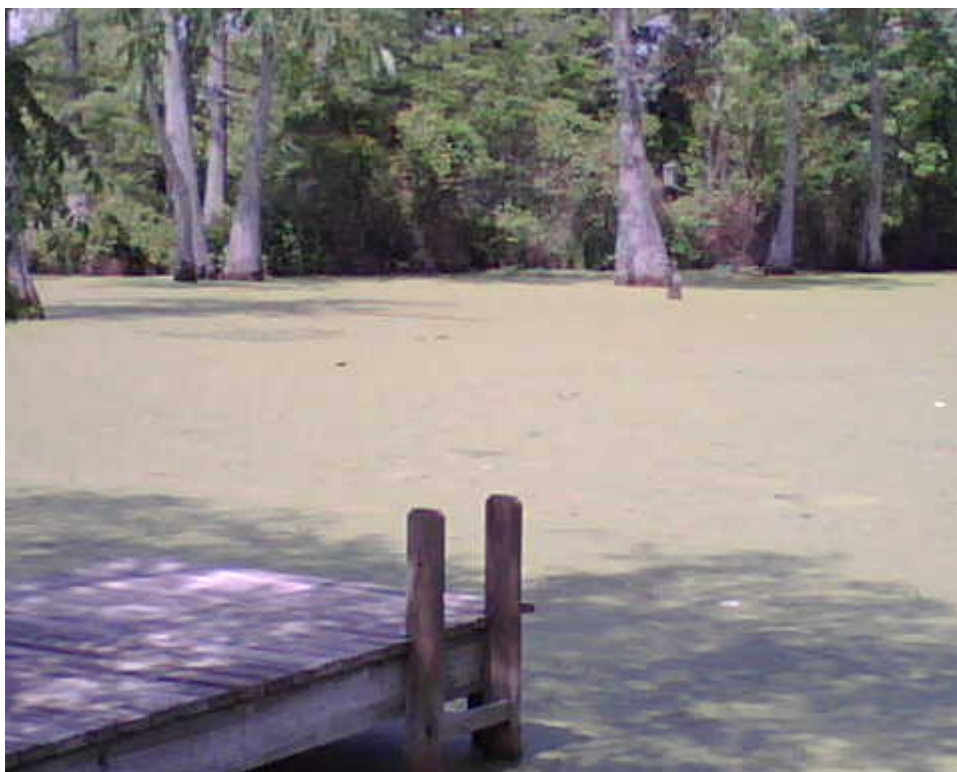
Figure 1. Duckweed ( Lemna minor ) infestation at Delta Wings Hunting Club prior to fluridone treatments.