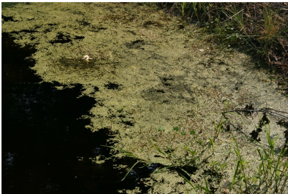
Figure 3. Duckweed ( Lemna minor ) at 30 DAT.