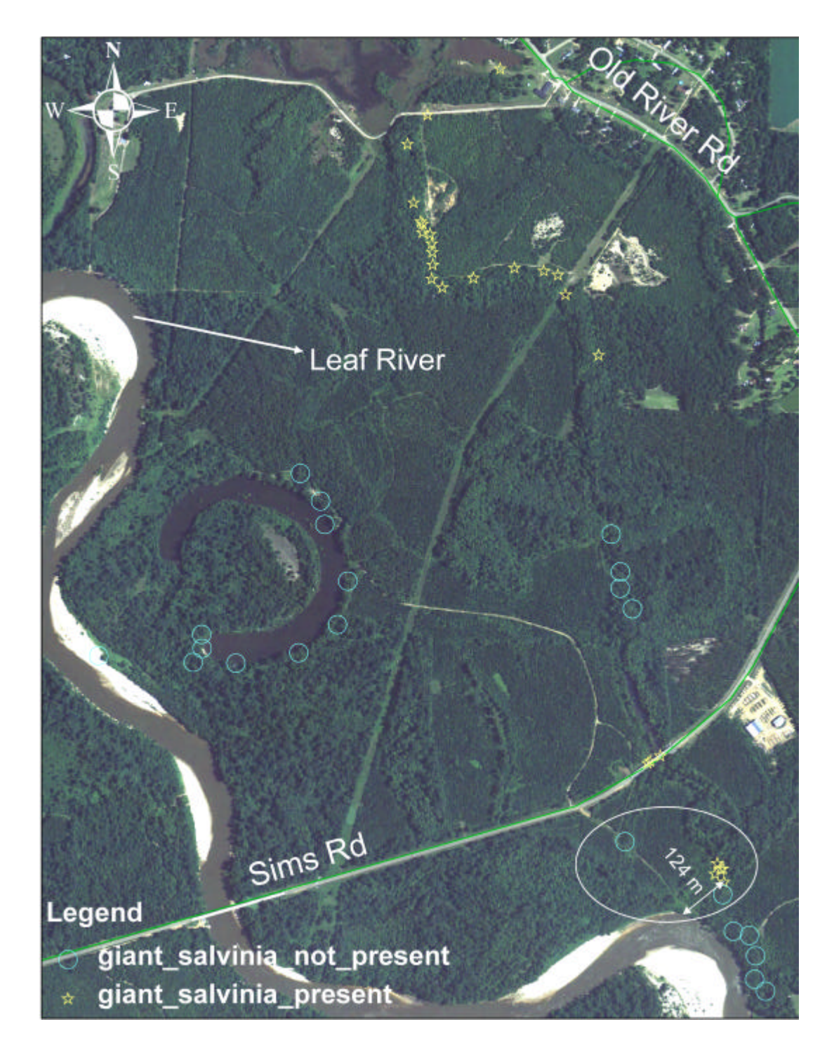
Figure 2. Giant salvinia distribution at Wedgeworth Creek, Hattiesburg, Mississippi. Arrow inside the ellipse represents the distance of the far most known giant salvinia location close to the Leaf River. Distance measured in meters.