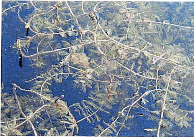
Figure 4. Eurasian watermilfoil stems at the water surface with flower spikes extending into the air.

and Nelson, 1985; see Figure 6). Apparently, all these states acted as loci for spread, with populations found in a number of northeastern, midwestern, southwestern, and southeastern states by 1960. By the 1980s, numerous sites occurred throughout the United States with the apparent exception of the northern plains states. Currently, it is one of the most widespread invasive aquatic plants, occurring in at least 45 states and in three Canadian provinces (Jacono and Richerson, 2003). Given its adaptability to a wide range of environmental conditions, it is the invasive aquatic plant most likely to be found in any state of the U.S., in waters ranging from cool mountain lakes to brackish estuaries. Once established in a new state, it continues to spread to new lakes.