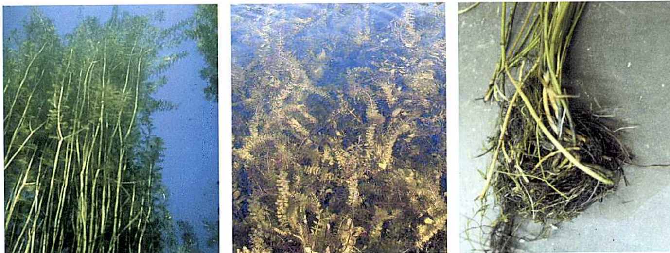
Figure 1 (left). Underwater view of the canopy of Eurasian watermilfoil in 12 feet water depth, in the clear waters of Lake George, New York. Figure 2 (middle). Eurasian watermilfoil growing close to the surface in the waters of Lake Hortonia, Vermont. Figure 3 (right). The dense root crown of Eurasian watermilfoil is how the plant grows and overwinters.

While seeds are produced, they generally do not appear to be an important source of new colonies (Hartleb et al., 1993). Seeds resist desiccation; so one possible mechanism of reproduction by seed is after drawdown (Standifer and Madsen, 1997). Reproduction is almost entirely by vegetative means, either through spread by stolons or fragments (Madsen et al., 1988 and Madsen and Smith, 1997). The plants produce fragments seasonally that act as dispersal units, and can survive for long periods of time before establishment occurs.